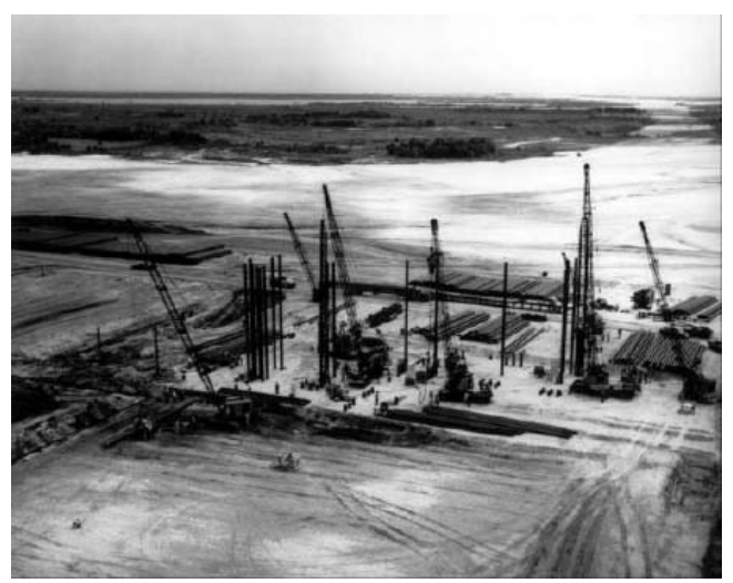
Driving the pilings for the VAB.

At the peak of activity, 10 pile drivers were in action. Three of them were new, electrically driven, vibratory drivers. When the piles reached the first thin stratum of limestone at about 36 meters, steam- or diesel-driven pile drivers took over and pounded the piles into the bedrock, which ranged from 151 feet to 171 feet (46 to 52 meters)