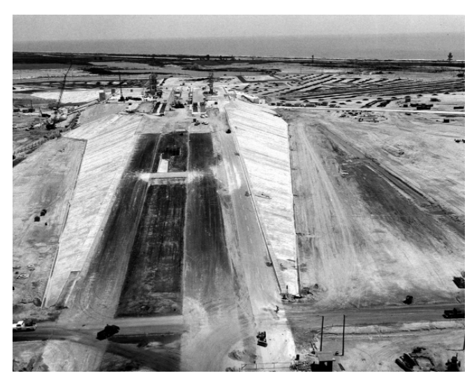
The flame trench bisects the launch pad.

An emergency egress system was part of the pad A contract. If a hazardous condition were to arise that allowed safe egress from the spacecraft, the astronauts could cross over to the mobile launcher on a swing arm. They would then ride one of the high-speed elevators to level A, slide down an escape tube to a thickly padded rubber deceleration ramp, and enter -- through steel doors -- a blast room, which could withstand an on-the-pad explosion of the entire space vehicle.