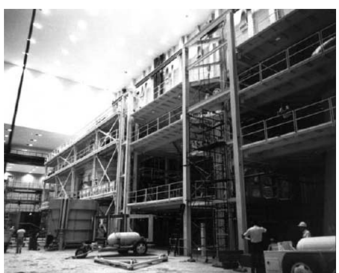
Interior of the Operations and Checkout building, August 1965. The two partly visible silos at left are altitude chambers.

The central instrumentation facility centralized the handling of NASA data and provided housing for general instrumentation activities that served more than one complex. The Launch Operations Center coordinated the