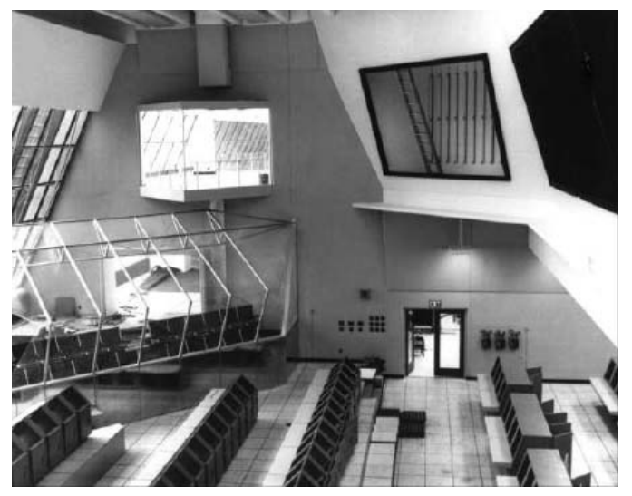
Firing room 1 under construction, August 1965. The VIP viewing area is under the glass wall, at left. The windows on the extreme left looked toward the pads. The triangular extension into the room above the VIP area was for the most distinguished guests.

The O & C building was a multi-storied structure of approximately 56,430 square feet (17,200 square meters), containing as much flexibility as the Apollo spacecraft that