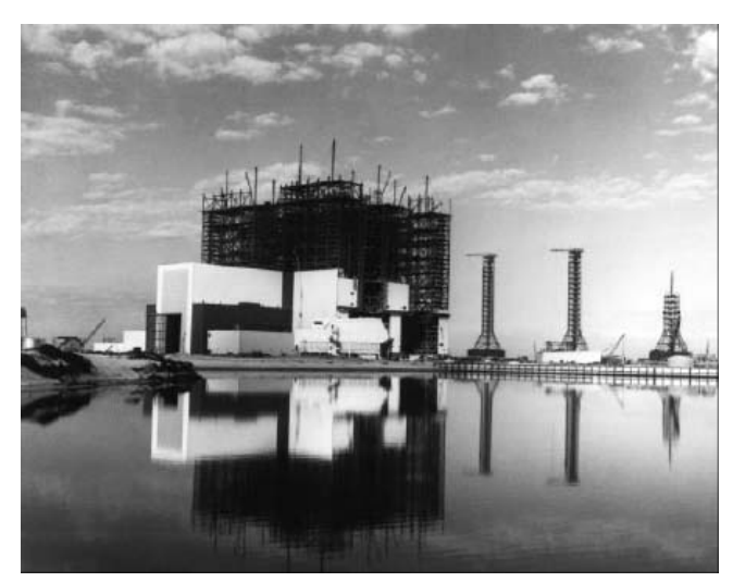
Mobile launchers are visible to the right of the VAB; at left, the launch control center seems to be part of the VAB.