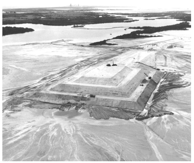
Dredged sand created the 80-foot-high mound that would become launch pad A.

The pumps piled up another portion of the dredged sand on the launch pad, creating a flat-topped pyramid of sand and shell 80 feet (24.4 meters) high. During the process, draglines, bulldozers and other earth-moving equipment molded the mound into the approximate shape of the pad. In a short period of time, the pyramid settled 3.9 feet (1.2 meters), compressing the soil beneath. Bulldozers