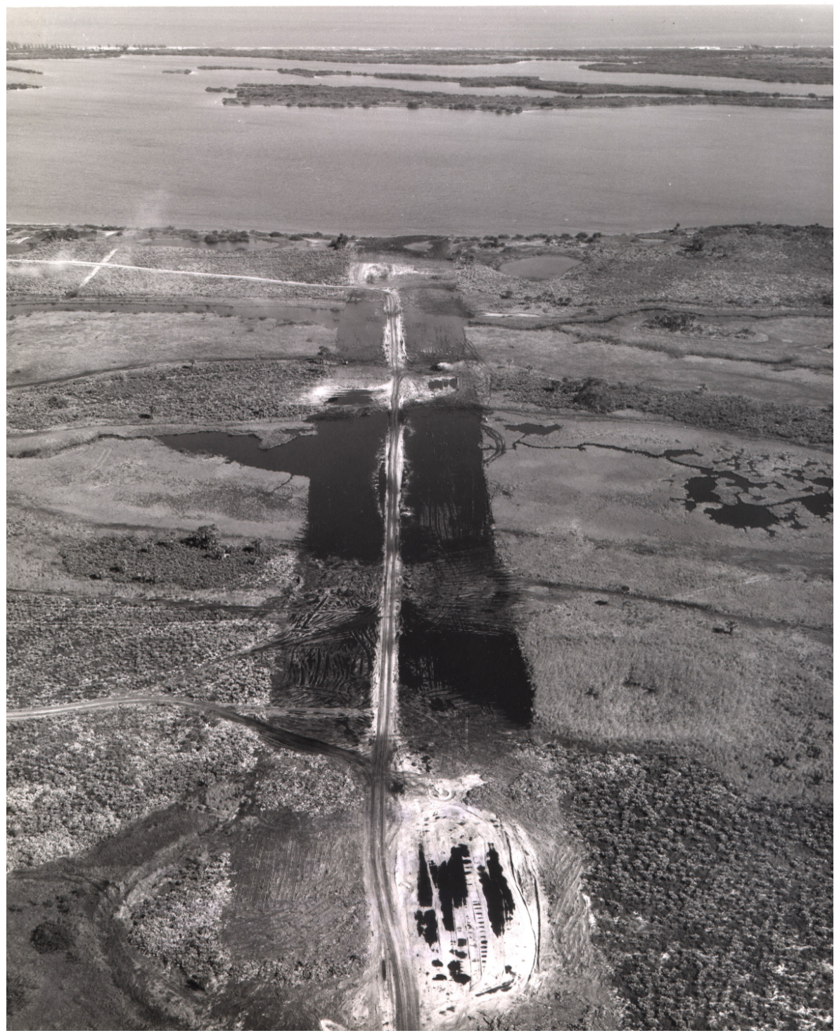
Aerial of the VAB site (foreground) and road to pad 39C (later pad A) during dredging of access channel, Jan. 23, 1963.

National Aeronautics and Space Administration