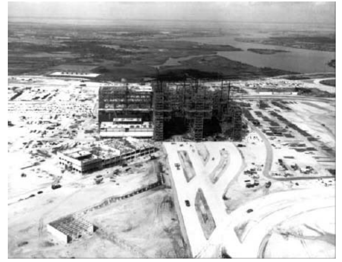
The VAB rises in steel to dominate the landscape. On the left is the lower Launch Control Center. In the foreground are the crawlerway and roads.

With steel column sections and other structural steel arriving at the job site, erection of the framework began in