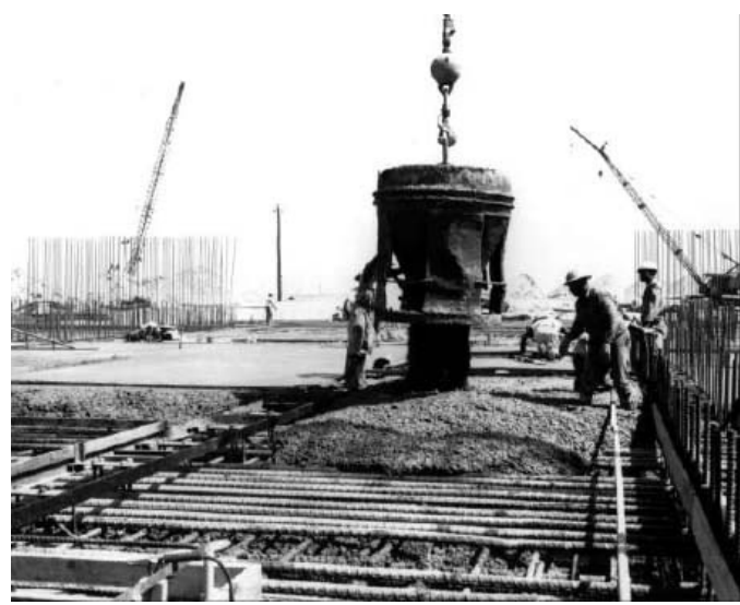
Pouring the concrete floor for the VAB.

Another critical part of the construction was the addition of three cranes. A 175-ton crane with a hook height of about 50 meters would run the length of the building and would traverse both the low bay and high bay areas above the transfer aisle. Two other cranes, with a 250-ton capacity and hook height of approximately 140 meters, would be capable of movement from an assembly bay on the opposite side. Although bridge cranes of this capacity are not unusual in heavy industry, there were unique requirements for precision, smoothness and control of their vertical and horizontal movement. The cranes would cost about $2 million.